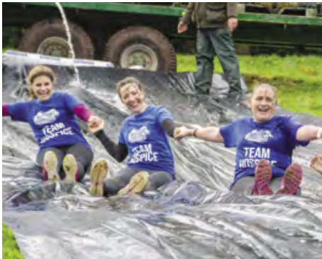
Making a splash for charity

The event featured some 1,300 participants swimming the 10km of the River Dart from Totnes to Dittisham. Kit raised £630 for Level Water who altogether raised £120,000.