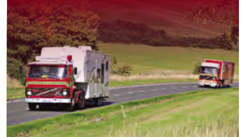
Photo: Duncan and James climbing a hill near Dingwall, to the north of Inverness

The cross-Scotland leg took in 153 miles of Scotland's magnificent Highlands but the journey back to HCT's headquarters in Tynholm was a bit more arduous covering over 313 miles and taking eight hours to complete.